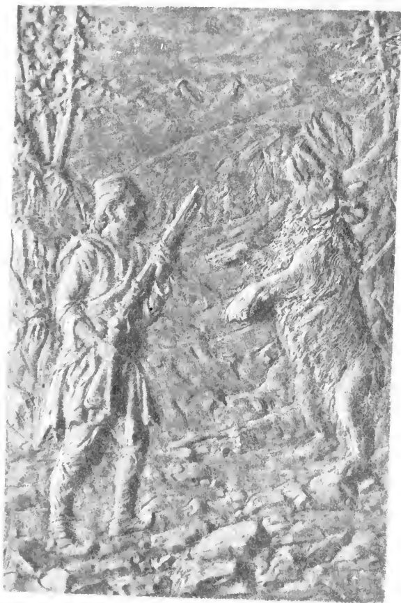
“ MAKING HIS SUPPLICATION ROSE ADAM-ZAD ‘THE BEAR!’ ”