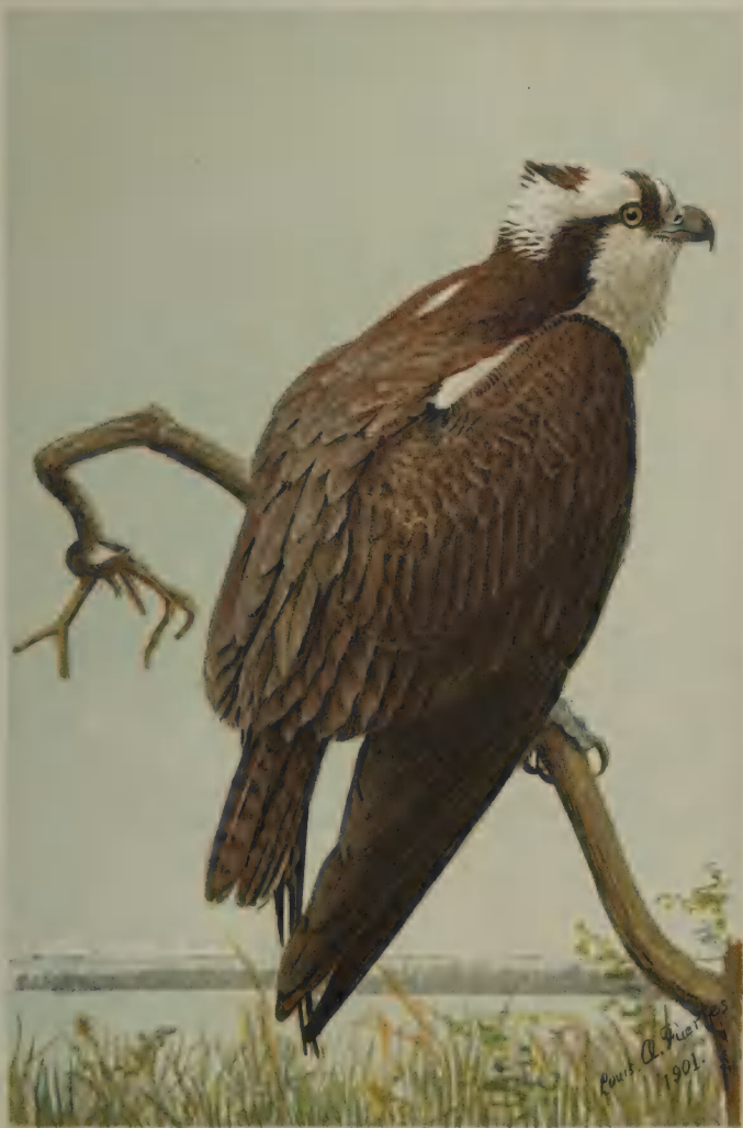
AMERICAN OSPREY OR FISH HAWK