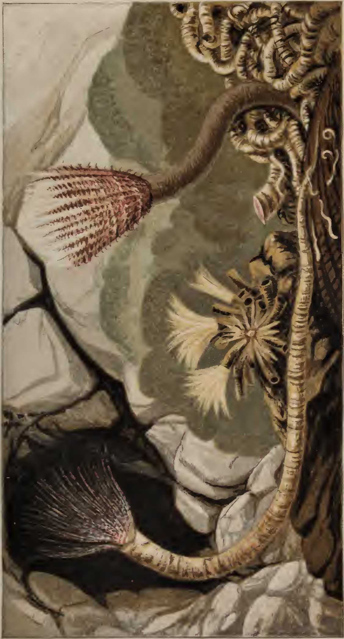
F. H. GOSSE, del.