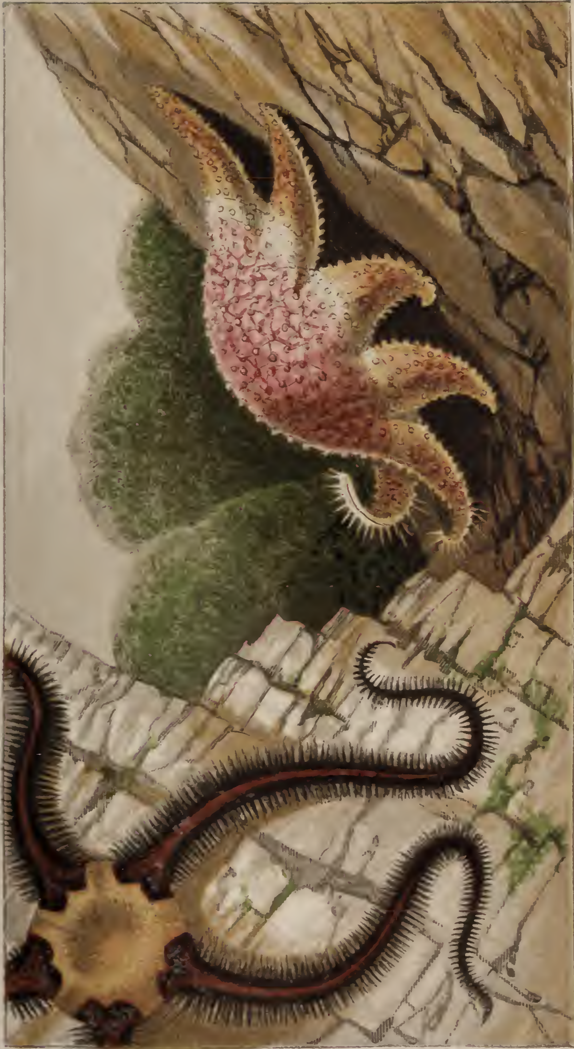
P. M. GOSSE, (del.)