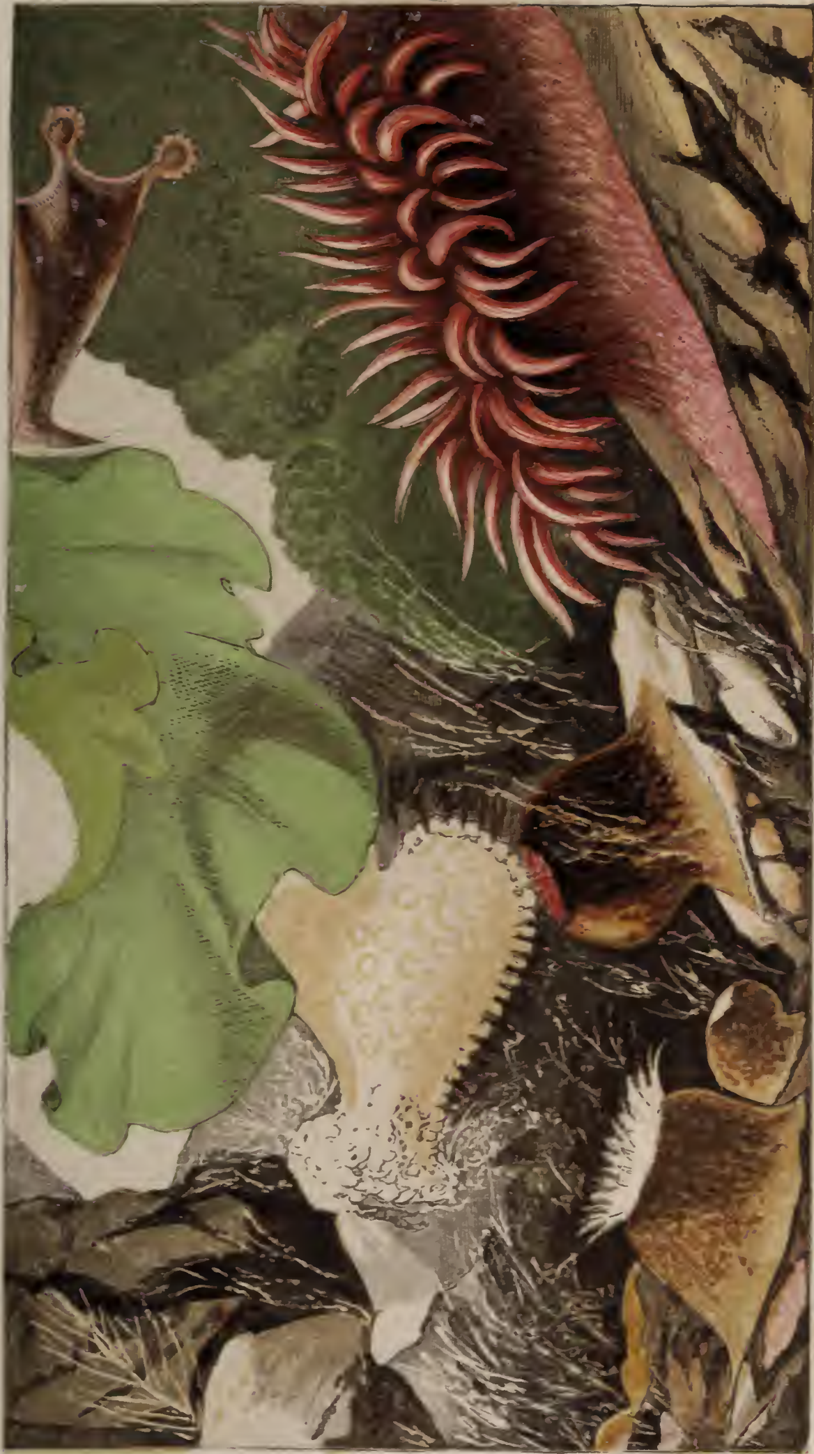
P. H. GOSSE, del.