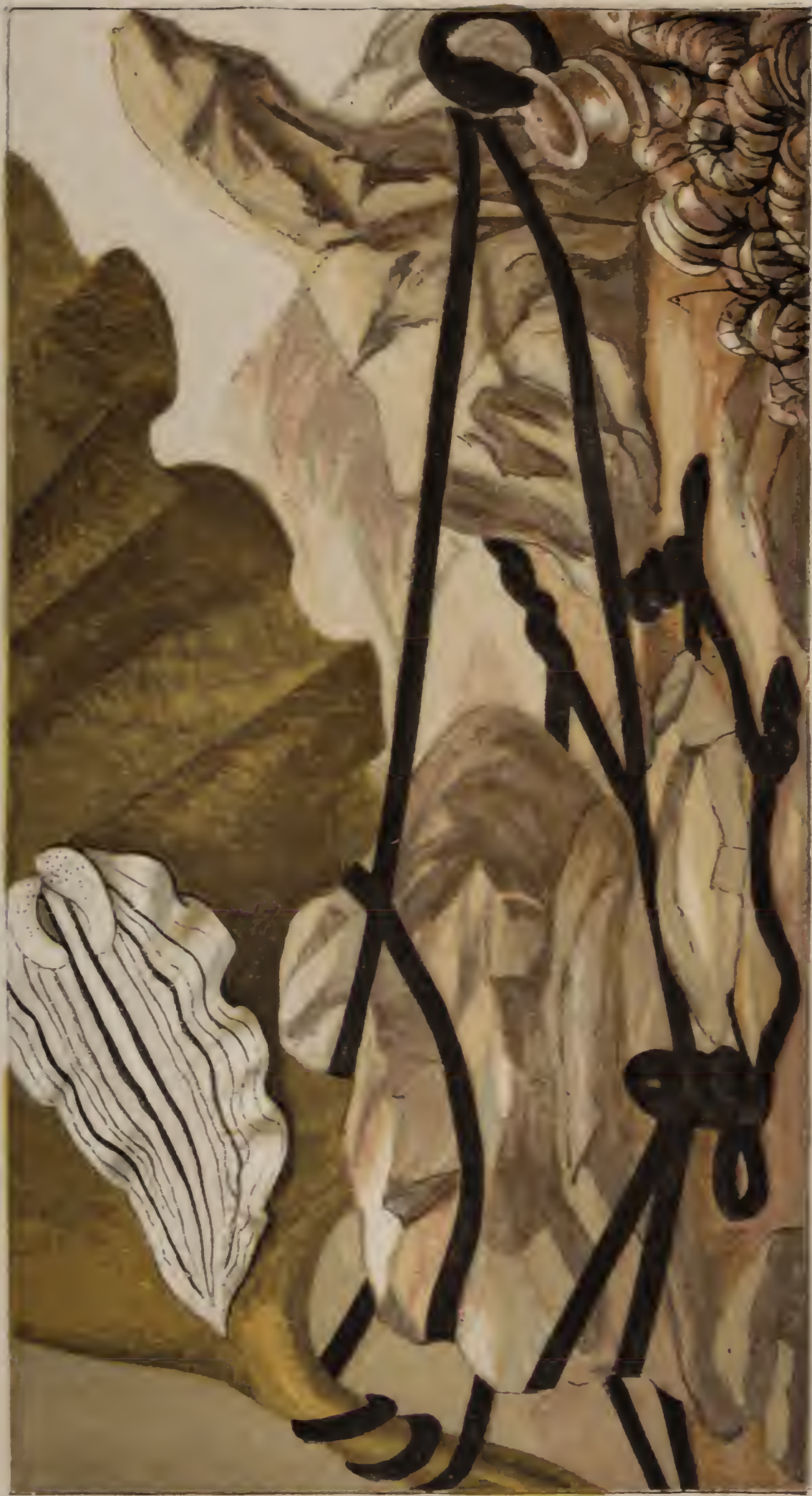
F. H. GOSSE, del.