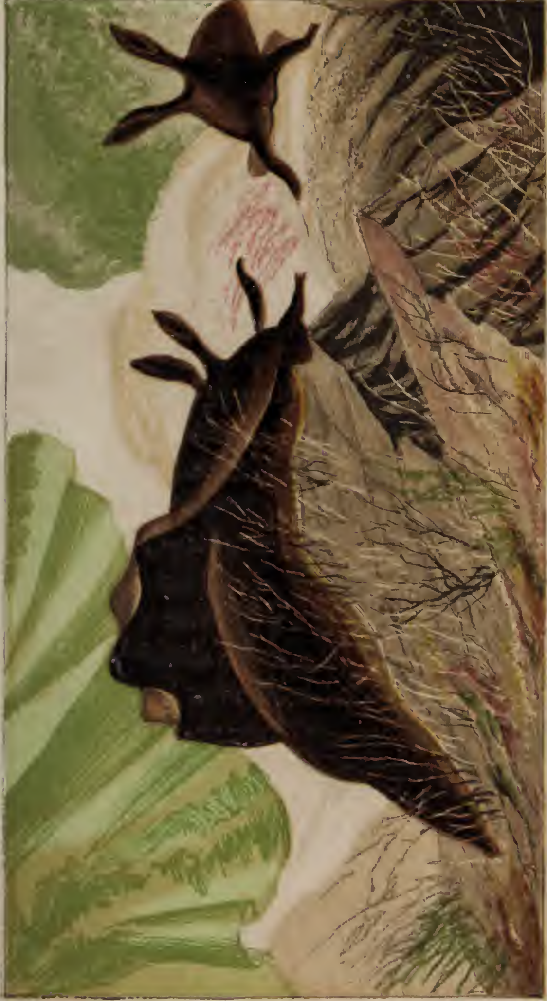
P. H. GOSSE, del.