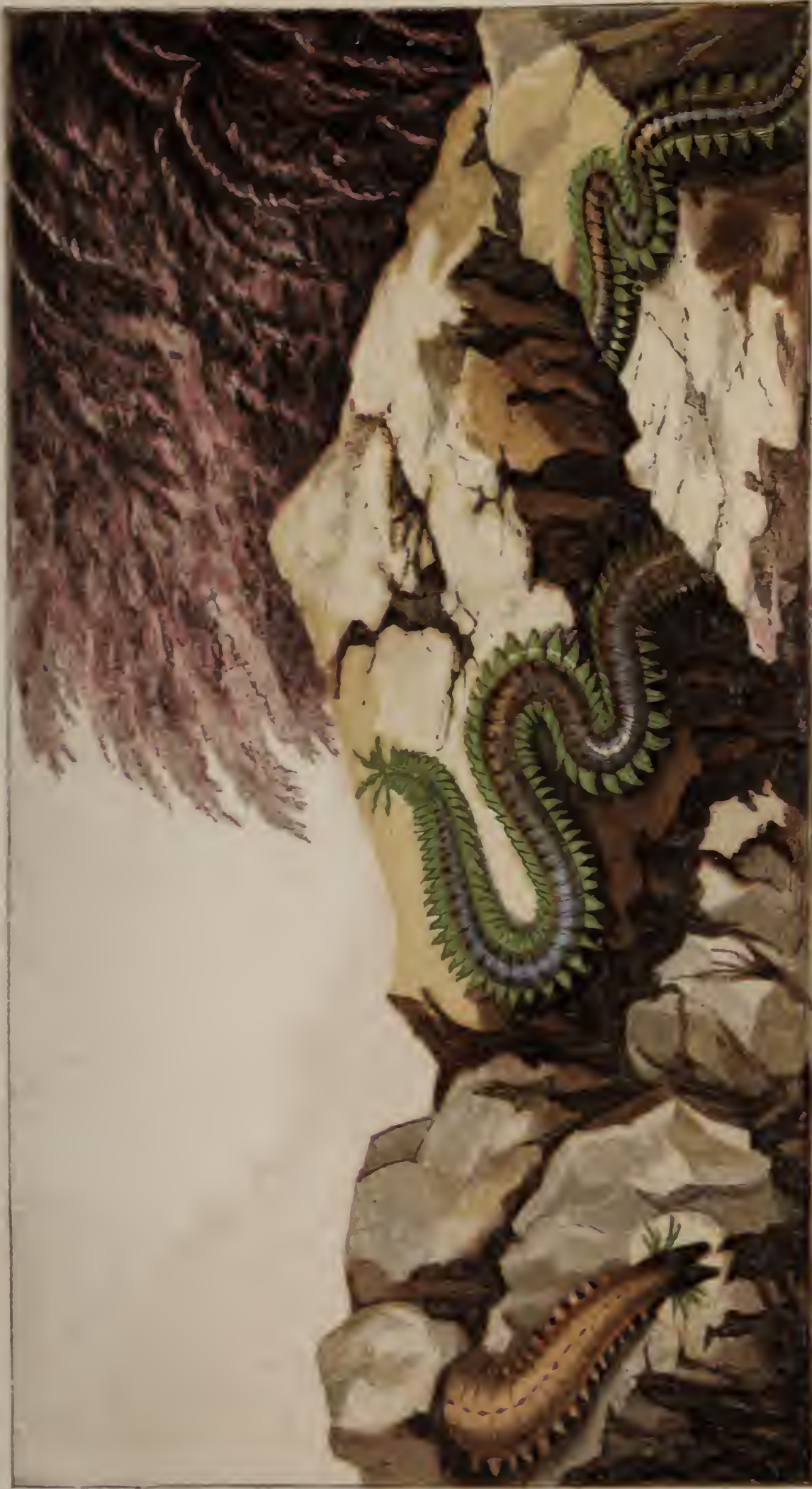
P. H. GOSSÉ, (del.)