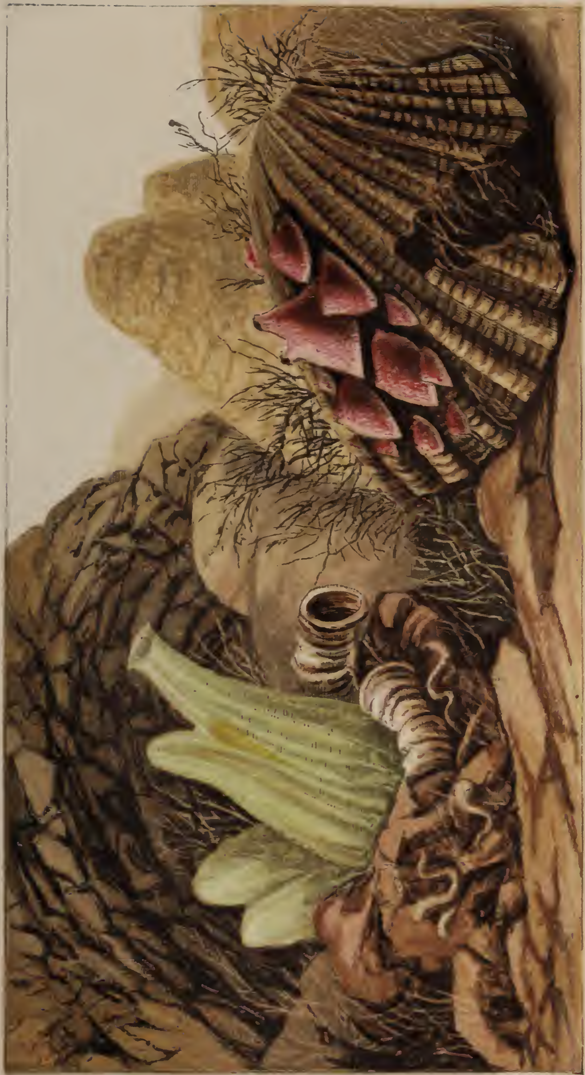
P. H. GOSSE, del.