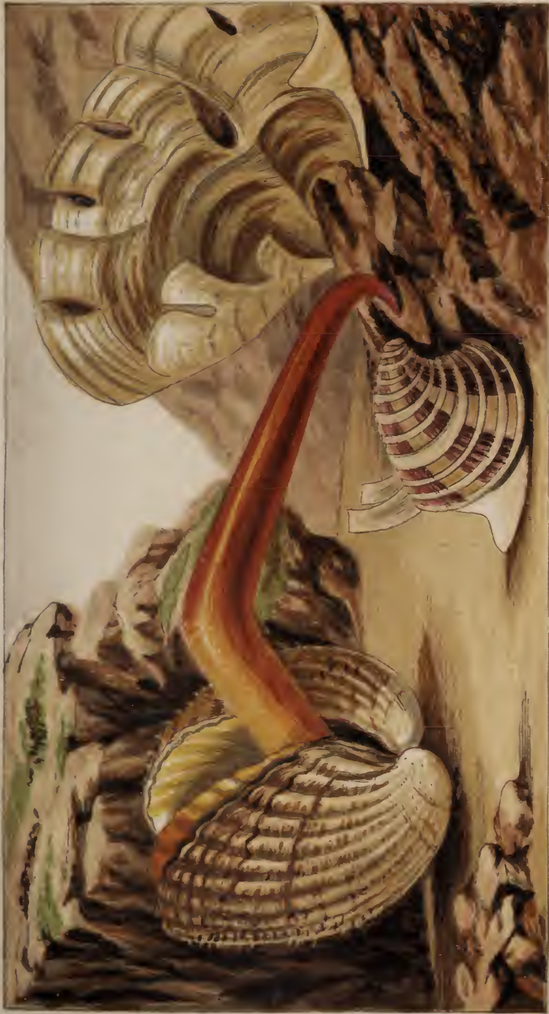
F. H. GOSSE, del.