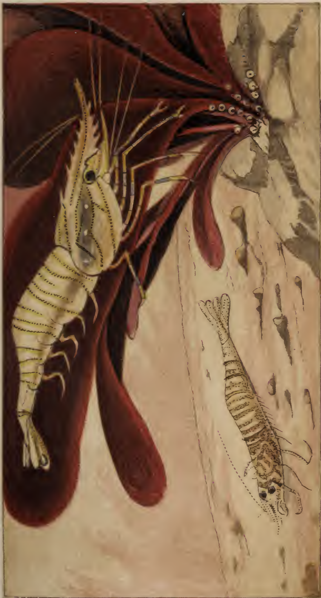
F. H. GOSSE, del.