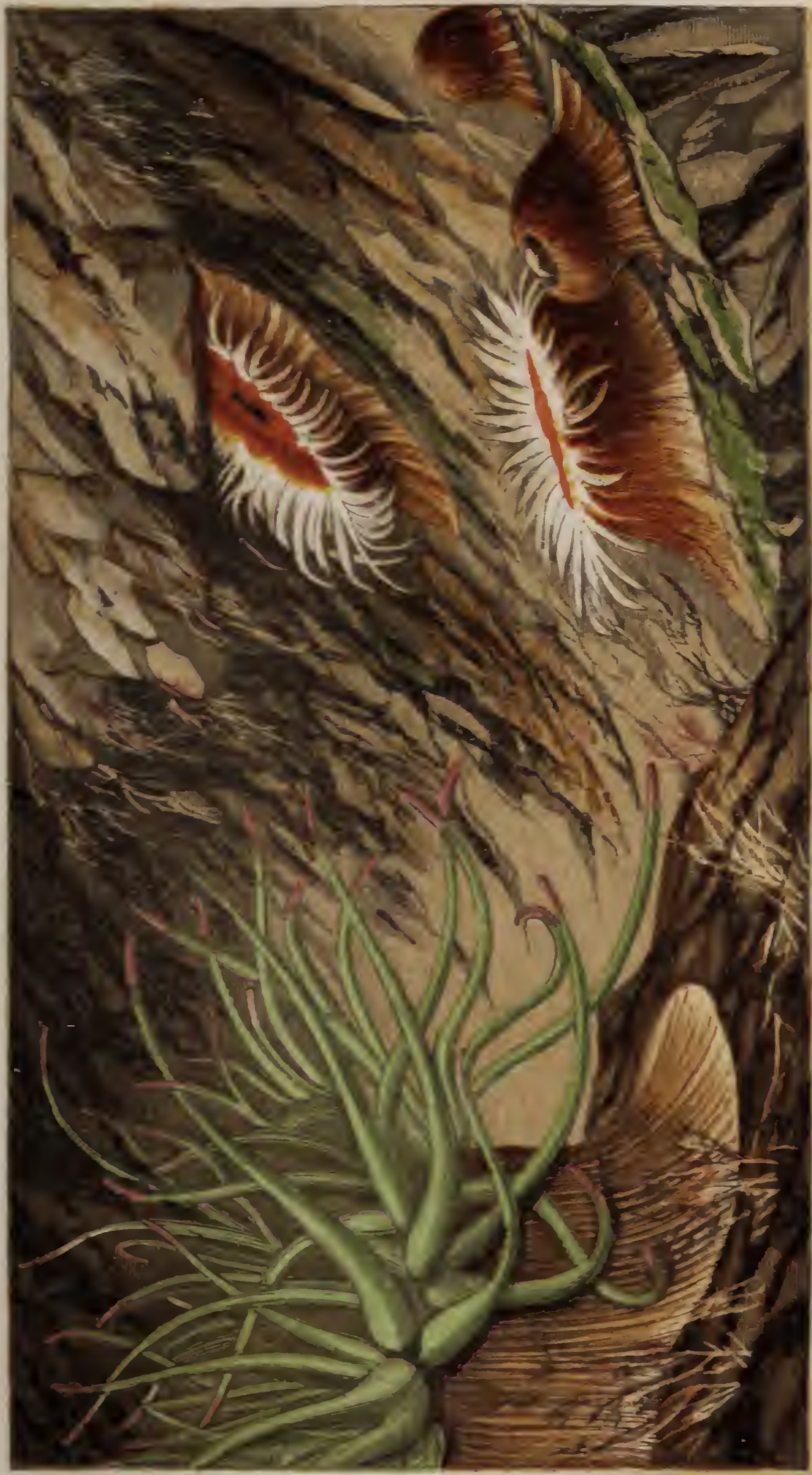
F. H. GOSSE, del.