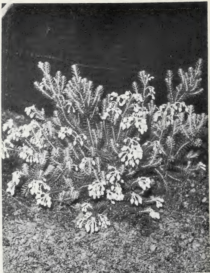
Erica sicula ssp sicula