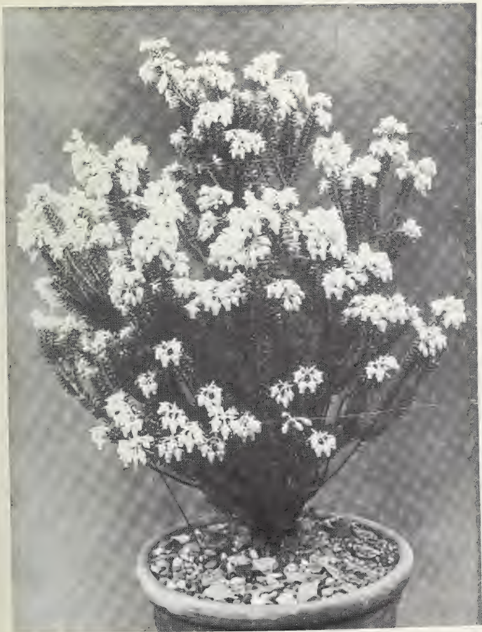
Erica sical ssp libanotica