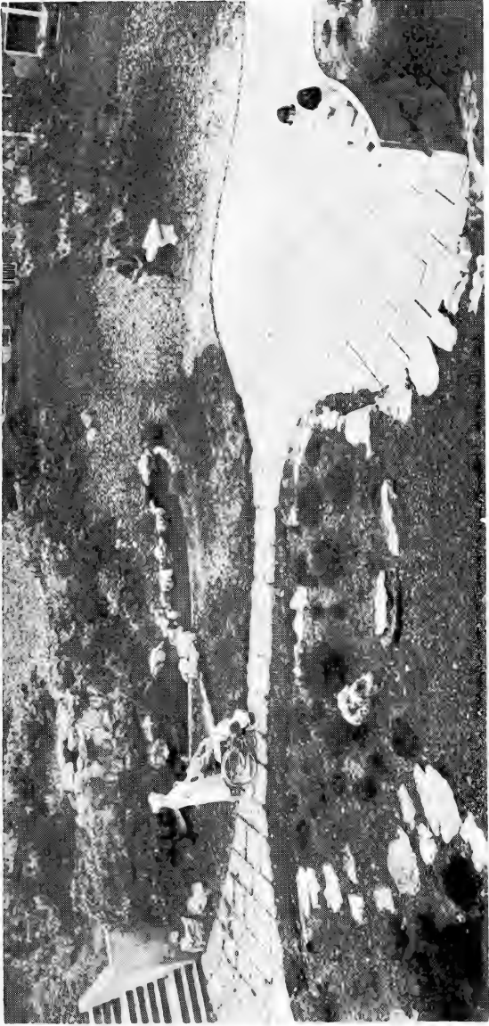
Englewood Hospital Heather Garden, New Jersey, U.S.A.