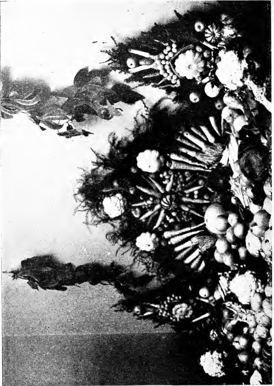
1944 HARVEST SHOW — DISPLAY OF VEGETABLES AND FRUITS BY PHILADELPHIA BRANCH, NATIONAL ASSOCIATION OF GARDENERS