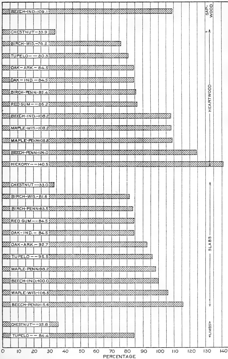
FIG. 3.—Relative yields of wood alcohol per cord of wood. (Average yield from heartwood and lumber of beech, birch, and maple from Wisconsin=100 per cent.)